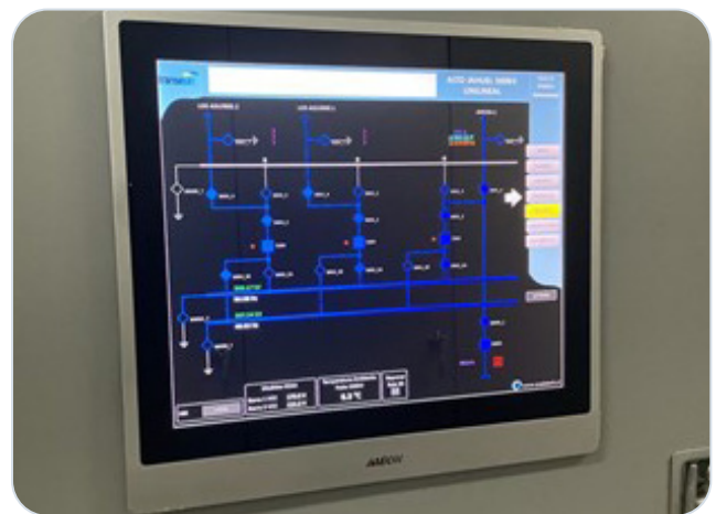
General one-line diagram on Touch Screen

As an architecture, a star connection was chosen, where the displays have an independent connection per yard, which has the advantage of not depending on the fiber optic links to the substation server room to collect data, but they work as STAND-ALONE equipment within each yard. Among the equipment integrated into the local HMIs are GE D25 bay controllers, protections (ABB-Siemens-General Electric, MICOM), CISCO communication switches and Schneider Electric ION meters. One of the great benefits of PcVue is that it is a multi-brand platform and easily adapts to equipment from any manufacturer.